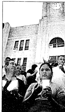
Voices heard: Members of the Hispanic community gather on the steps of City Hall in Hazleton, Pa., during a candlelight vigil on July 12, 2006. Hazleton has an ordinance penalizing employers who hire illegal aliens.

Commerce Secretary Carlos Gutierrez told a Senate hearing recently that immigrants account for 15% of